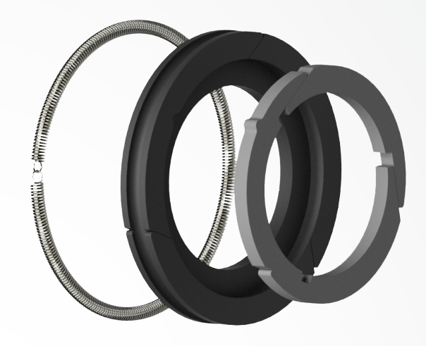
Exploded view of a double acting EMISSIONGUARD TR<sup>2</sup> packing ring